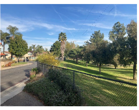
Figure 3 – Upland Hills Country Club Waterline Easment.