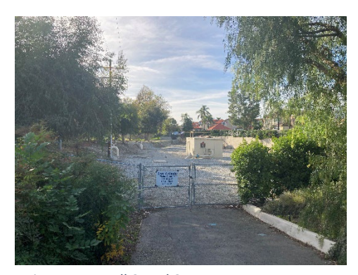
Figure 4 – Well 3 and 24.