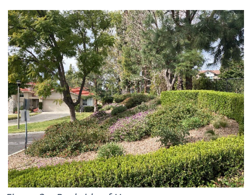
Figure 2 – Backside of Homes.

within golf courses and planned communities such as ensuring continual access to HOA and Golf Course Representatives and not interrupting any activities withing such facilities. We will provide seamless management and coordination with SAWCo, Affected HOAs, Upland Country Club, local jurisdictions, and contractor throughout each phase of the project.