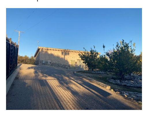
Figure 3 – Creek Inlet.

Ardurra will design and provide construction phase services for approximately 3,350 LF of new 24-inch diameter pipeline, mostly within Mesa Terrace, along with a hydraulic break in proximity to the existing hydrogenator plant and a new screening mechanism either at the Forebay, Creek Inlet, or V-Screen Pump Station. Existing pipeline sections to be replaced will be abandoned per industry accepted standard.