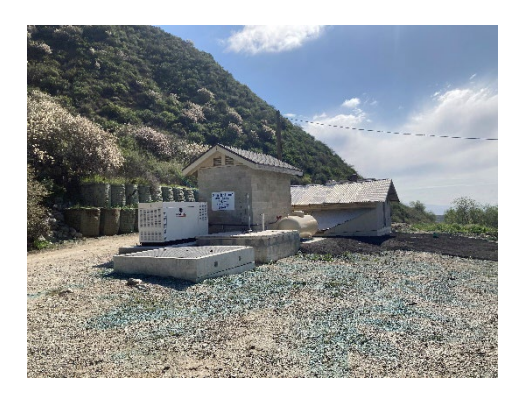
Figure 4 – V-Screen Pump Station.