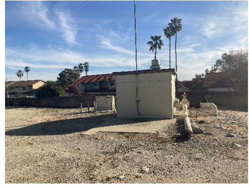
Figure 1 – Well 31.

Ardurra has extensive experience in providing services, from design and through construction, for conveyance projects. We understand the unique project challenges