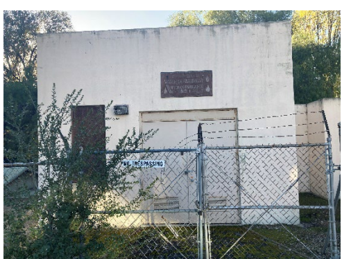
Figure 1 – Hydrogenerator Plant.

This SAWCo project is mostly located in the residential community of San Antonio Heights, California, but will also include consideration of screening facility in the upper canyon, close to San Antonio Creek. The Paloma Curve Hydraulic Break consists of an abandoned hydrogenator plant owned by the City of Upland and a concrete Hydraulic Break owned by the Company. The facility was designed to convert hydraulic energy into electrical energy and remove any remaining hydraulic energy prior to discharge at the Company's Reservoir Number Four. (Figure 1). During periods of high-water flow (sustained average-or-higher rainfall events) the amount of water flowing through the facility can create significant low frequency vibrations. These events occur only periodically (once every couple of years). The current property owner has requested that the Company eliminate the noise and/or abandon the facility.